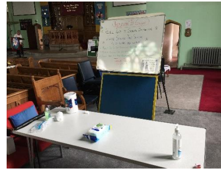
Ref No: 4

It is most important to ensure that all congregants take these actions: Upon entry, get signed in, use hand sanitiser AT THE DESK, accept a 'wet wipe' and use it to clean their chosen seating place by wiping the hand rail on the pew immediately in front of them as well as the actual seat, remove the wipe to a bin upon leaving and use hand sanitiser before leaving the building.