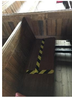
Ref No: 2