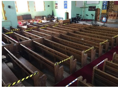
Ref No: 1